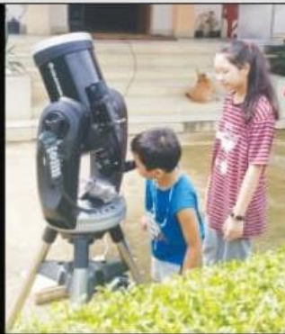
Children at AP Science Centre gazing at the solar 'ring of fire' eclipse in the state Capital on Sunday.